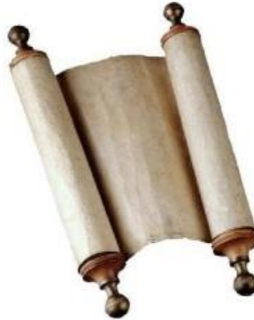
The Bible & The Book of Mormon, "...shall be one in mine hand..." (Ezekiel 37:19)